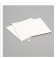
Mini Stampin' Dimensionals - 144108