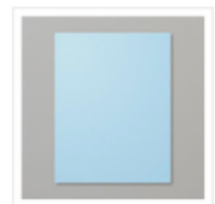
Balmy Blue 8-1/2" X 11" Cardstock - 146982