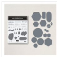
Hello Beautiful Bundle (English) - 158047