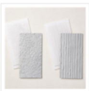
Stripes & Splatters 3D Embossing Folders - 157980