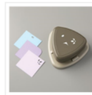
Detailed Trio Punch - 146320