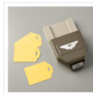
Fancy Tag Topper Punch - 152711