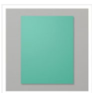
Just Jade 8-1/2" X 11" Cardstock - 153079