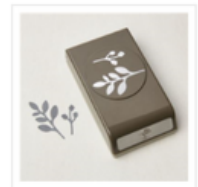
Bough Punch - 157711