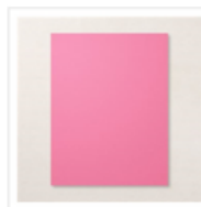
Polished Pink 8-1/2" X 11" Cardstock - 155710