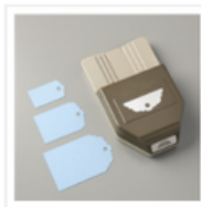
Delightful Tag Topper Punch - 149518